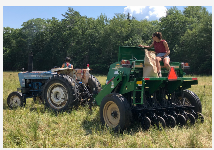
Pictured: Wolfe's Neck Staff seeding the trial with a No-Till Drill in July, 2022

was awarded a Conservation Innovation Grant (CIG) from the NRCS to examine if plantings of annual, warm season grasses using a no-till drill is a viable solution to maintain forage production during the 'summer slump.' The objectives of the trial include monitoring soil health, plant emergence, and forage quality indicators. At the conclusion of the trial Wolfe's Neck will host a pasture walk and workshop to discuss the outcomes of the trial, adapting to drought on pasture, and the challenges and successes with no-till pasture seeding.